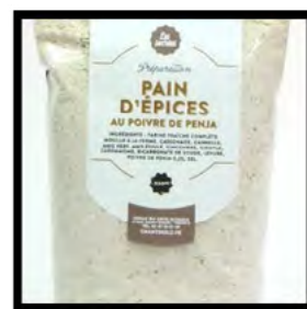
Evocation of Poivre de Penja as an ingredient of other products.