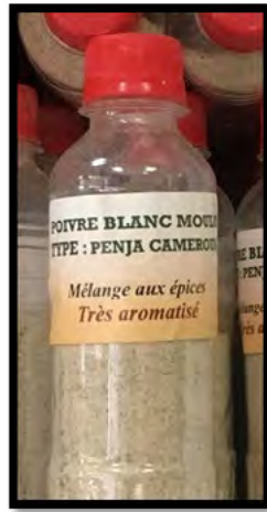
Poivre de Penja-DUCROS: GI or non-GI?

Use of the name poivre de Penja with delocalisers: 'Poivre blanc type Penja Cameroun' ( 107 ).