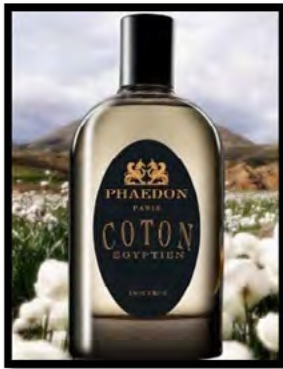
Evocation of 'Egyptian cotton' in its translated form on a different product than the product used in the application (perfume).