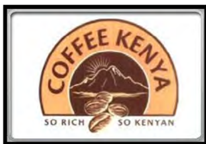
Use of the name 'Kenya' on coffee as an indication of provenance

The Geneva Act – which modernises the Lisbon Agreement 110 – may be one way for African countries to efficiently protect their GIs especially against the use of their names on dissimilar products or against those uses that amount to 'imitation' of the registered GI 111 .