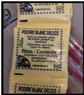
Picture of a fraudulent use of a registered GI 106 .